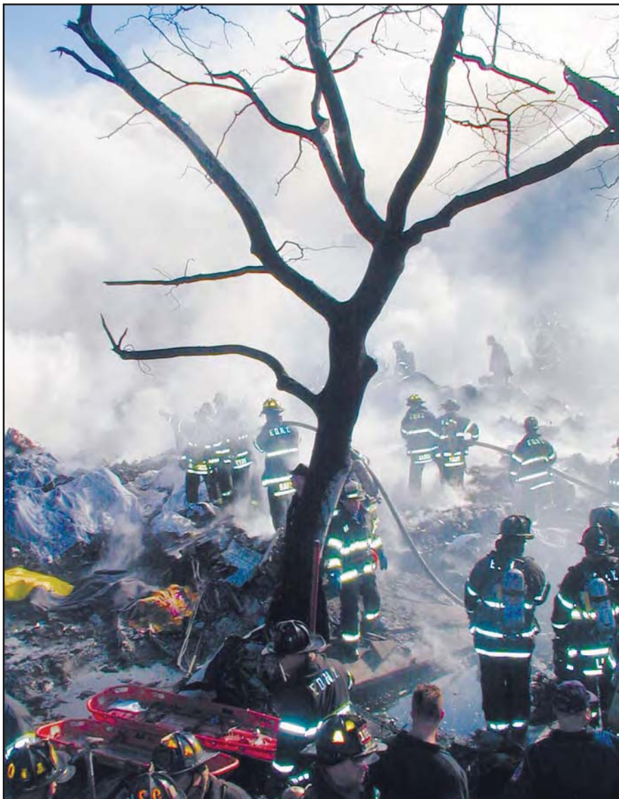
Firefighters operate hand-lines onto burning parts of the airliner. Note the stokes baskets in foreground.

Additional hand-lines were stretched for final extinguishment.