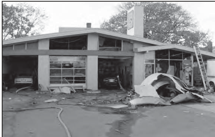
The second plane engine landed in the gas station above at 445 Beach 129th Street. Fortunately, it missed the pumps and a 10,000-gallon gasoline truck that was making a delivery.