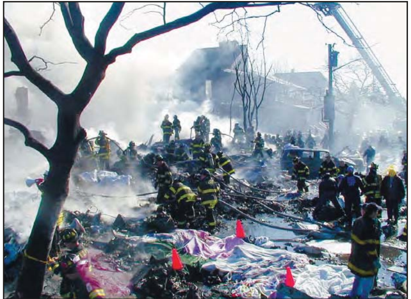
View looking south on Beach 131st Street from Newport Avenue. Crash completely destroyed the first three houses on the left side of the street on impact. This is the area where Captain Mundy rescued an elderly couple from the front porch.

Units were assigned to operate on the north side of Newport Avenue at Beach 130th and 131st Streets, where the corner house on each block was fully involved. Tower Ladder 107, commanded by Lieutenant Stephan Trogele, set up on Newport Avenue, midway between Beach 130th and 131st Streets, and operated on the fully involved house on each corner on the north side of this street.