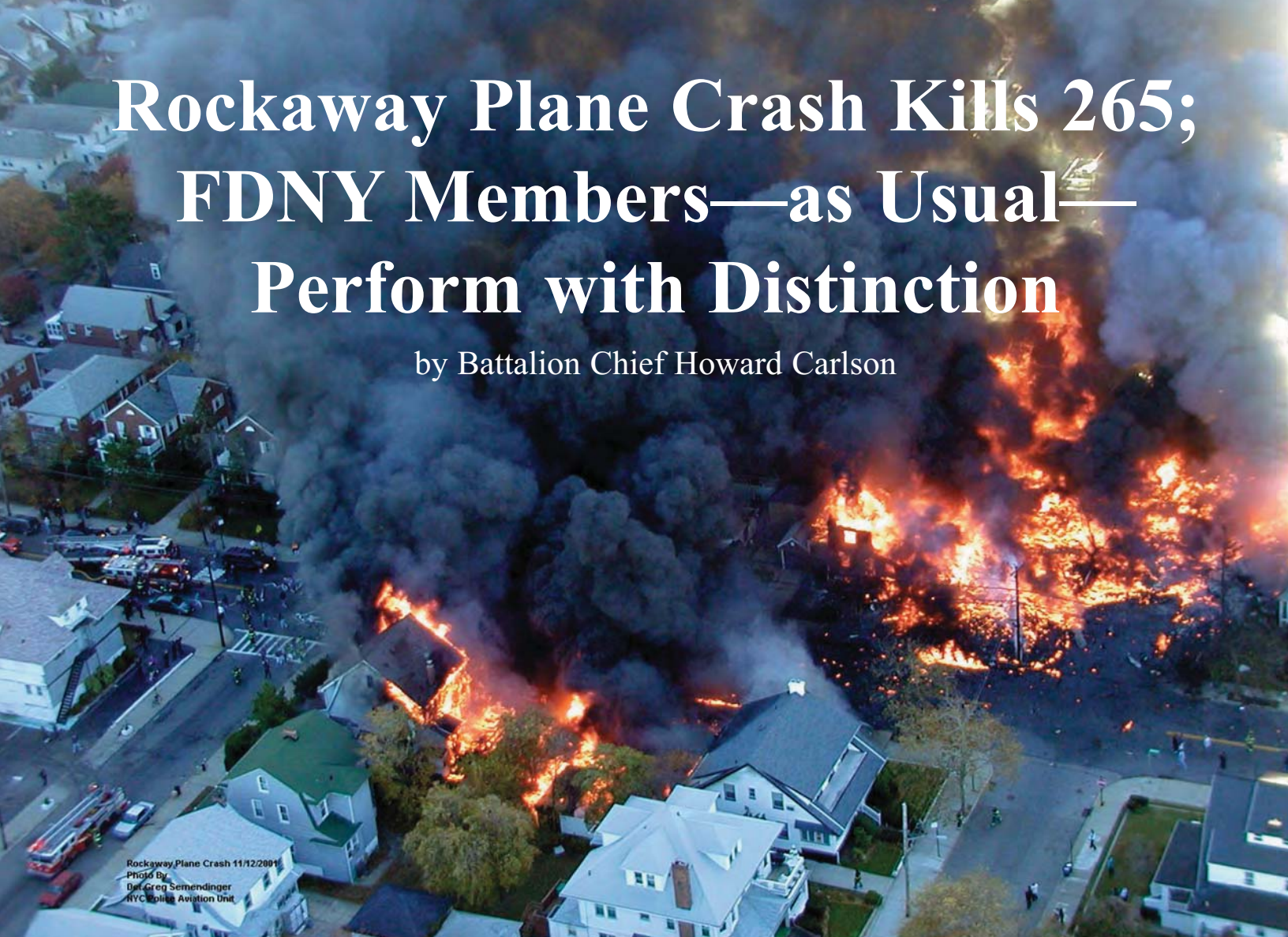
Rockaway Plane Crash 11/12/2001